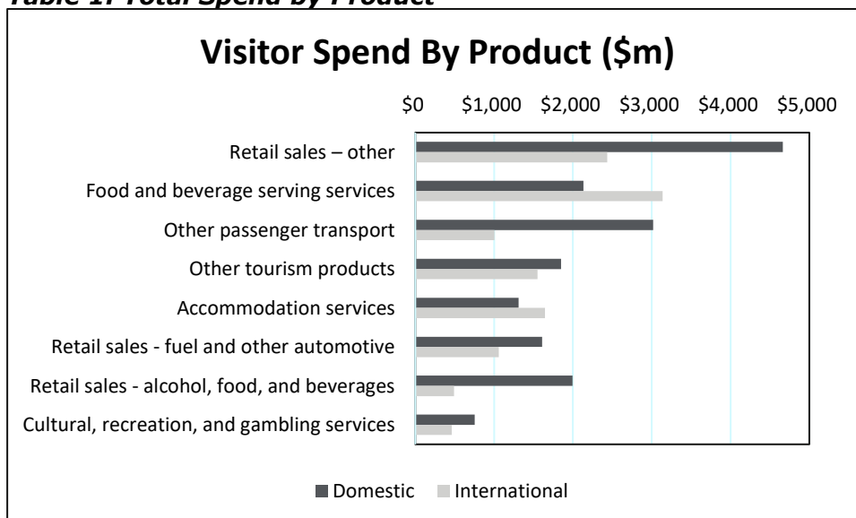
Table 1: Total Spend by Product 1